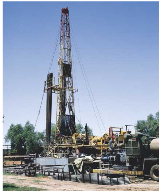
Drilling for groundwater.

The groundwater systems respond very slowly to the massive disturbances that have been outlined in this booklet. That is why the full consequences of the human impacts have begun to be felt only after decades, or even a century after the actions which have caused the changes. As has been observed, "we now know that the incipient degradation processes will often continue for centuries to come. We have released a timebomb with a slow fuse... Things will get worse before they get better". Decisions made today regarding land and groundwater management will have implications for many generations. 'Doing-nothing' is not a viable option as the degradation processes will continue and accelerate. There must be change in the way land and water are currently managed. This change will involve accepting the presence of salt and learning to live within a saline environment. It will involve the management of groundwater as part of the total hydrological system with a focus on achieving long-term sustainable use and the minimisation of salinity problems. It is imperative that the remaining groundwater resources are properly managed in the future to ensure that we do not continue to repeat mistakes of the past. Remediation of problems associated with groundwater is expensive and in some cases impossible.